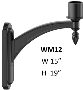
WM12 W 15" H 19"