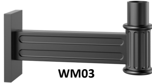
WM03 W 17" H 10"