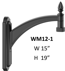
WM12-1 W 15" H 19"