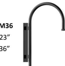
CWM36 W 23" H 36"

CWM02-E2* - For use with GC6200 & GC6500 Series Fixtures