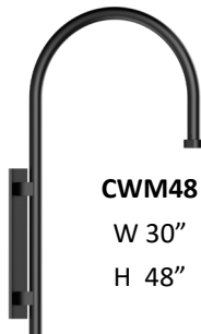
CWM48 W 30" H 48"

CWM36* - For use with GC6000 Series Fixtures