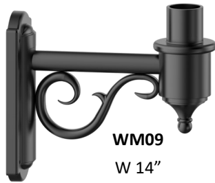
WM09 W 14" H 14"